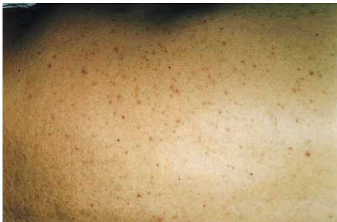
Fig. 1. Maculopapular rash over the trunk of the patient.

fever or leukopenia, or as a potentially lethal pneumonitis. Other clinical manifestations include colitis, ulcerative gastrointestinal ulcers, esophagitis, hepatitis, cholecystitis, pancreatitis, renal failure, meningoencephalitis, and rarely, myocarditis and chorioretinitis (1, 3). However, skin manifestations are extremely infrequent. We present a case of biopsy-proven CMV skin involvement that resolved after appropriate antiviral therapy, and we review the spectrum of dermatologic lesions associated with CMV infection.